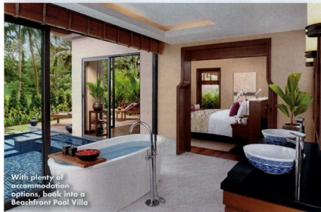
With plenty of accommodation options, book into a Beachfront Pool Villa

Leaving our Residence was a difficult thing to do, simply because it was so beautiful we wanted to stay there forever. But we did manage to tear ourselves away from our home from home to explore the resort. The private beach is beautiful, with low waves lapping at the shore, making it