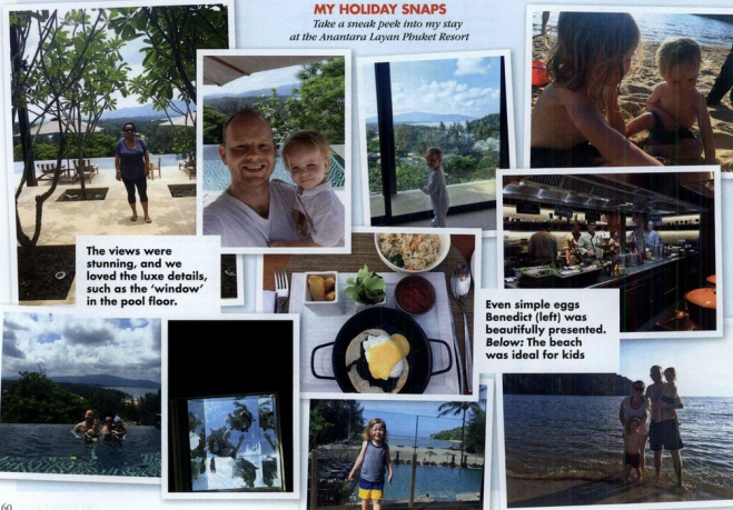
The views were stunning, and we loved the luxe details, such as the 'window' in the pool floor.

Take a sneak peek into my stay at the Anantara Layan Phuket Resort