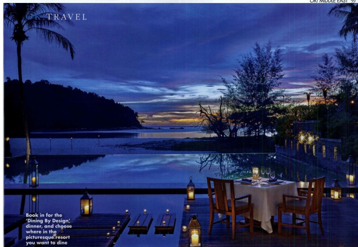
Book in for the 'Dining By Design' dinner, and choose where in the picturesque resort you want to dine