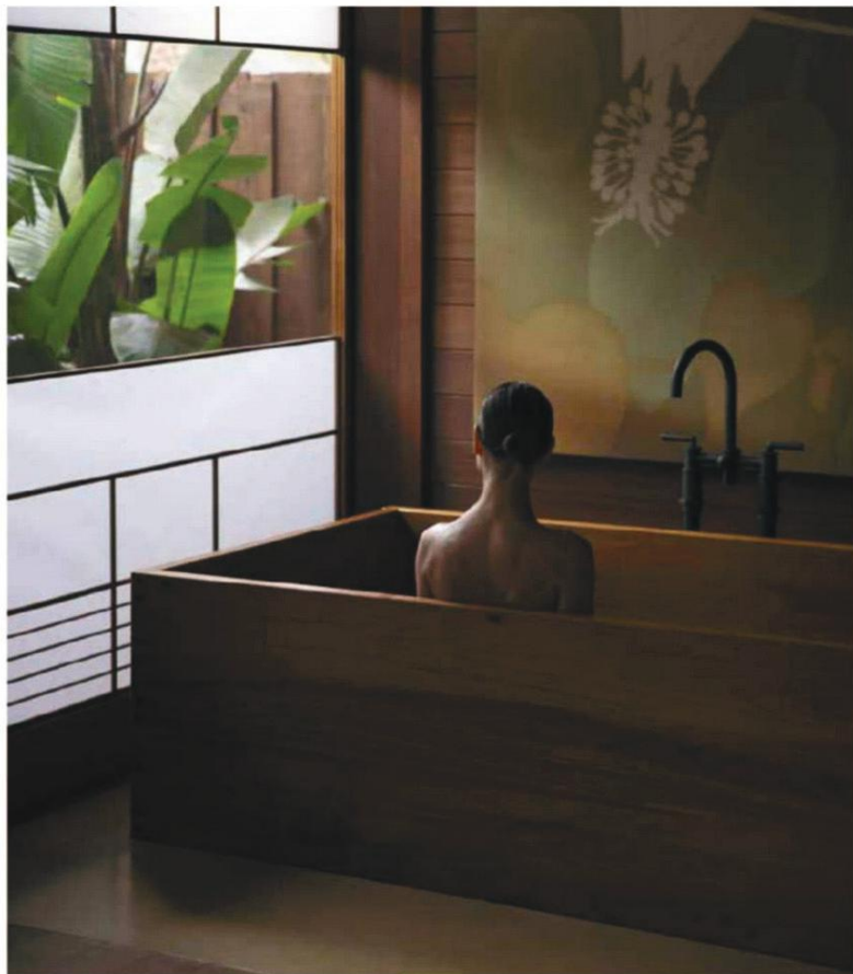
Healthful Havens: Se Spa at Grand Velas Riviera Maya (top); and Sensai Lānaʻi, A Four Seasons Resort (bottom)